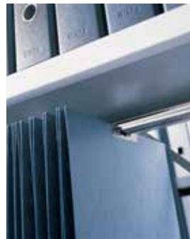
ZT pendel frame